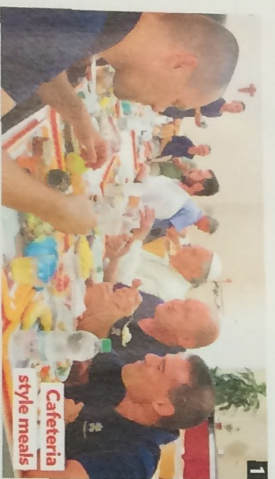
1 Francis (in 14) lunches in the Vatican workers' mess. 2 , At Spiezia Optics Sept. 3

'PRAY FOR ME' It's Francis's refrain with everyone he meets, from a young disabled man in St. Peter's Square (in 13) to the inmates at Rebibbia prison in April (far left), whom he urged to "pray that the Lord washes away my filth as well."