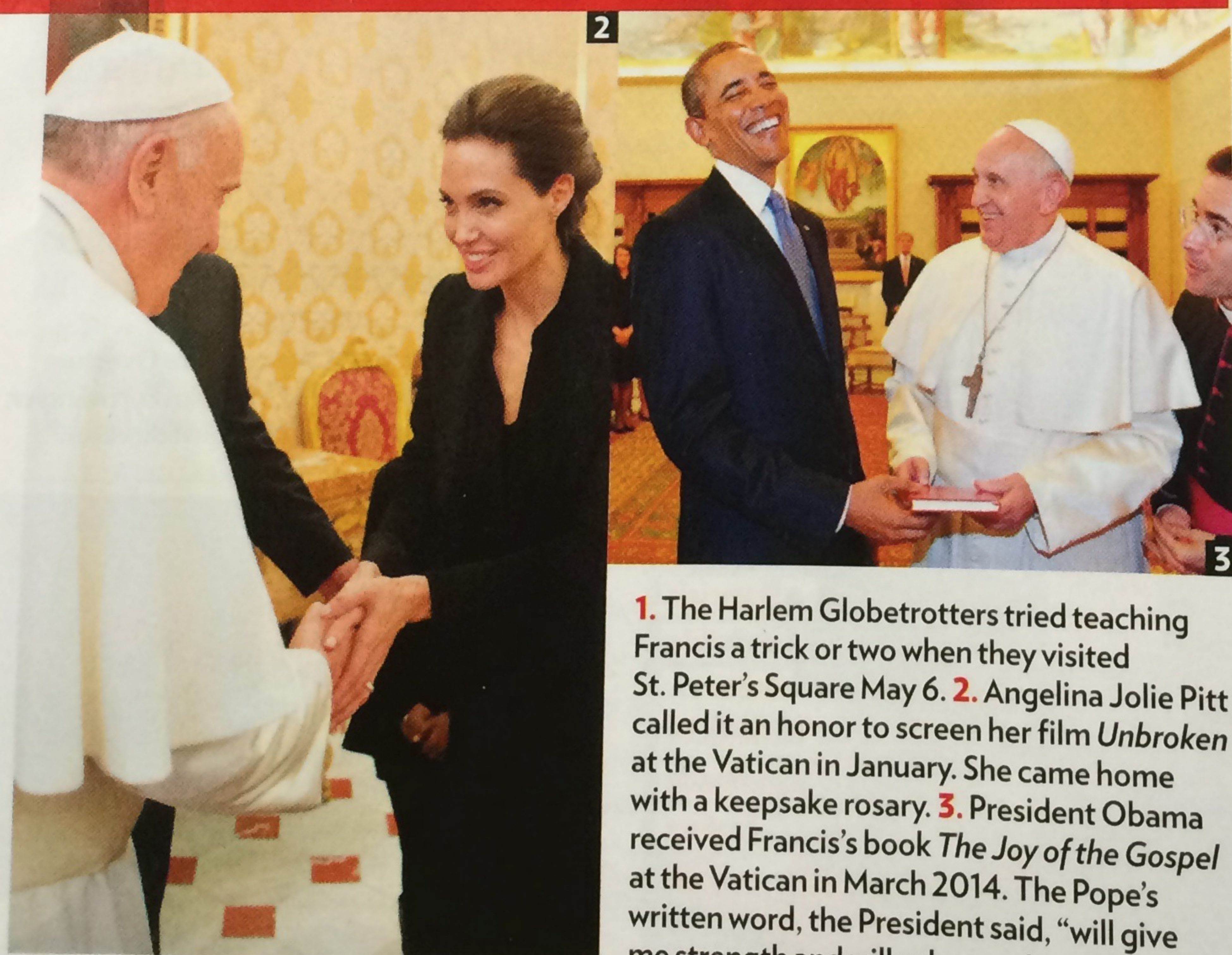
1. The Harlem Globetrotters tried teaching Francis a trick or two when they visited St. Peter’s Square May 6. 2. Angelina Jolie Pitt called it an honor to screen her film Unbroken at the Vatican in January. She came home with a keepsake rosary. 3. President Obama received Francis’s book The Joy of the Gospel at the Vatican in March 2014. The Pope’s written word, the President said, “will give me strength and will calm me down.”