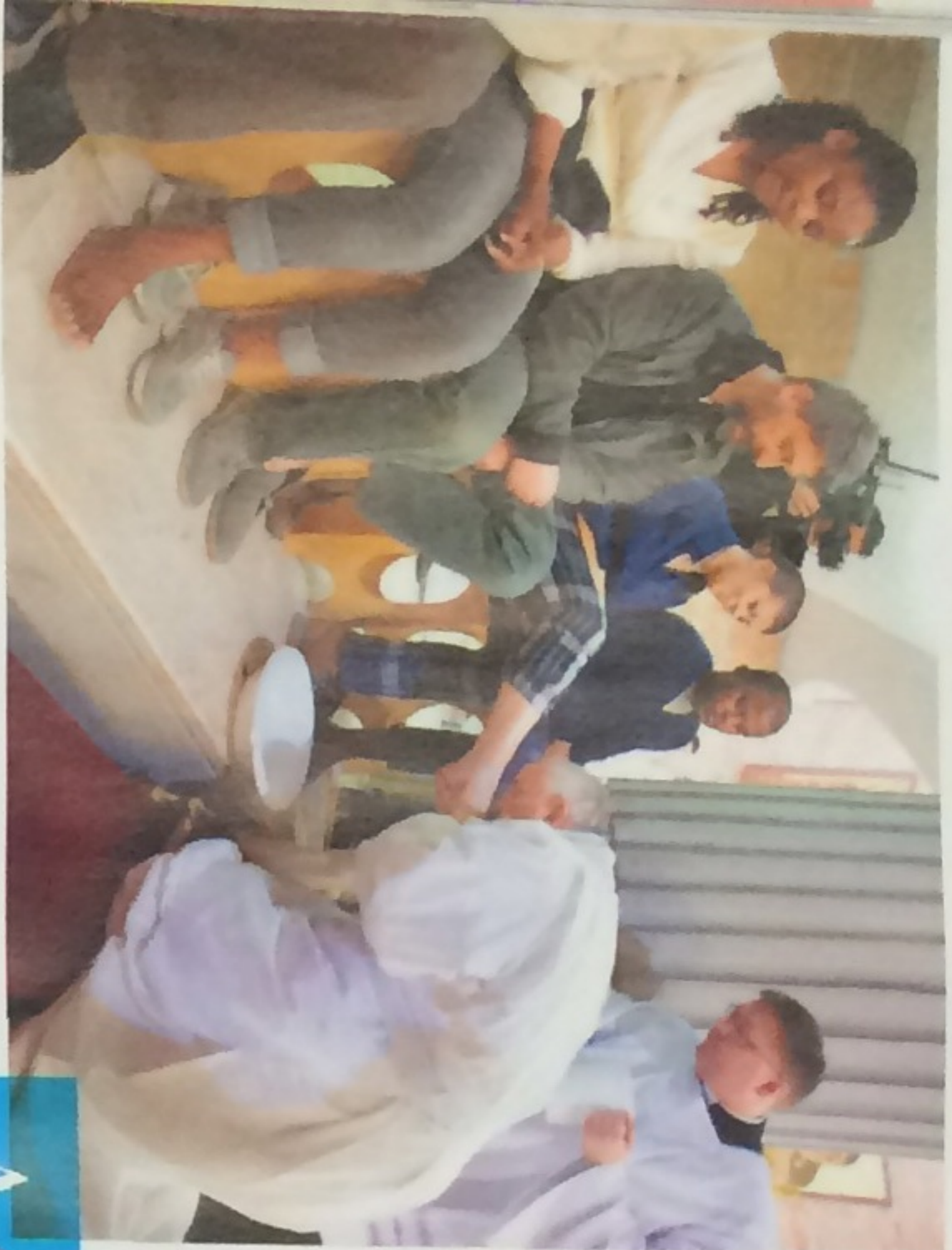
talk of love and acceptance."

The former Argentine "street priest" known as Jorge Mario Bergoglio developed his inclusive philosophy while ministering in the darkest corners of Buenos Aires. As Pope, he has prioritized the poor, refused the imperial trappings of the Vatican and radically softened the Church's tone on everything from homosexuality ("Who am I to judge?" he asks) to abortion (Women should be forgiven their "agonizing and painful decision," as