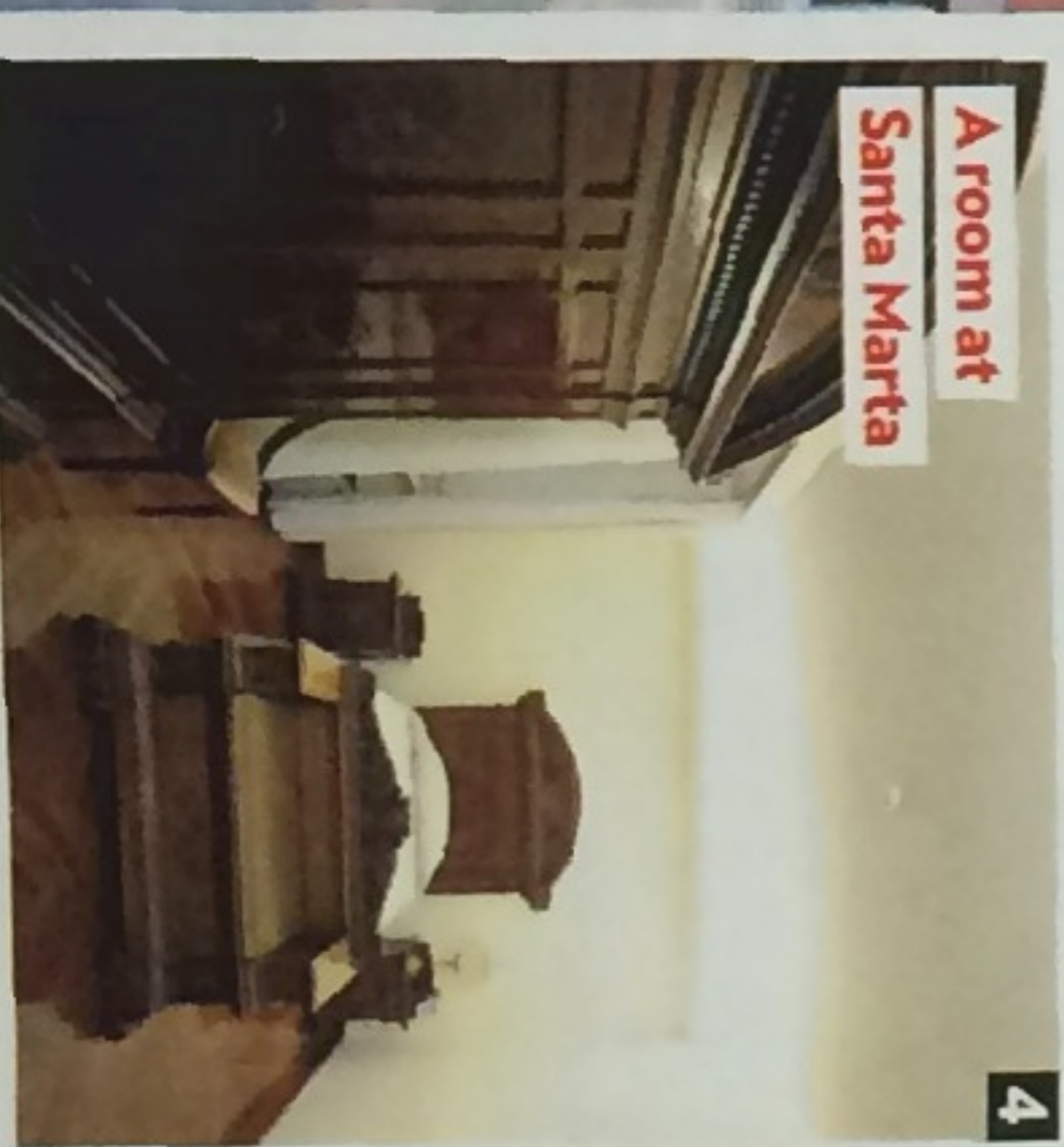
4 A room at Santa Marta

Francis took a vow of poverty when he became a Jesuit at age 32 and he sets a frugal tone at the Vatican. Rejecting the limo and palatial apartments of Benedict XVI and a long line of other predecessors, Francis bunks with dozens of housemates at the Santa Marta guesthouse, where, having gained 15 lbs. in office, he's under doc's orders to cut back on the buffet's pasta del giorno .