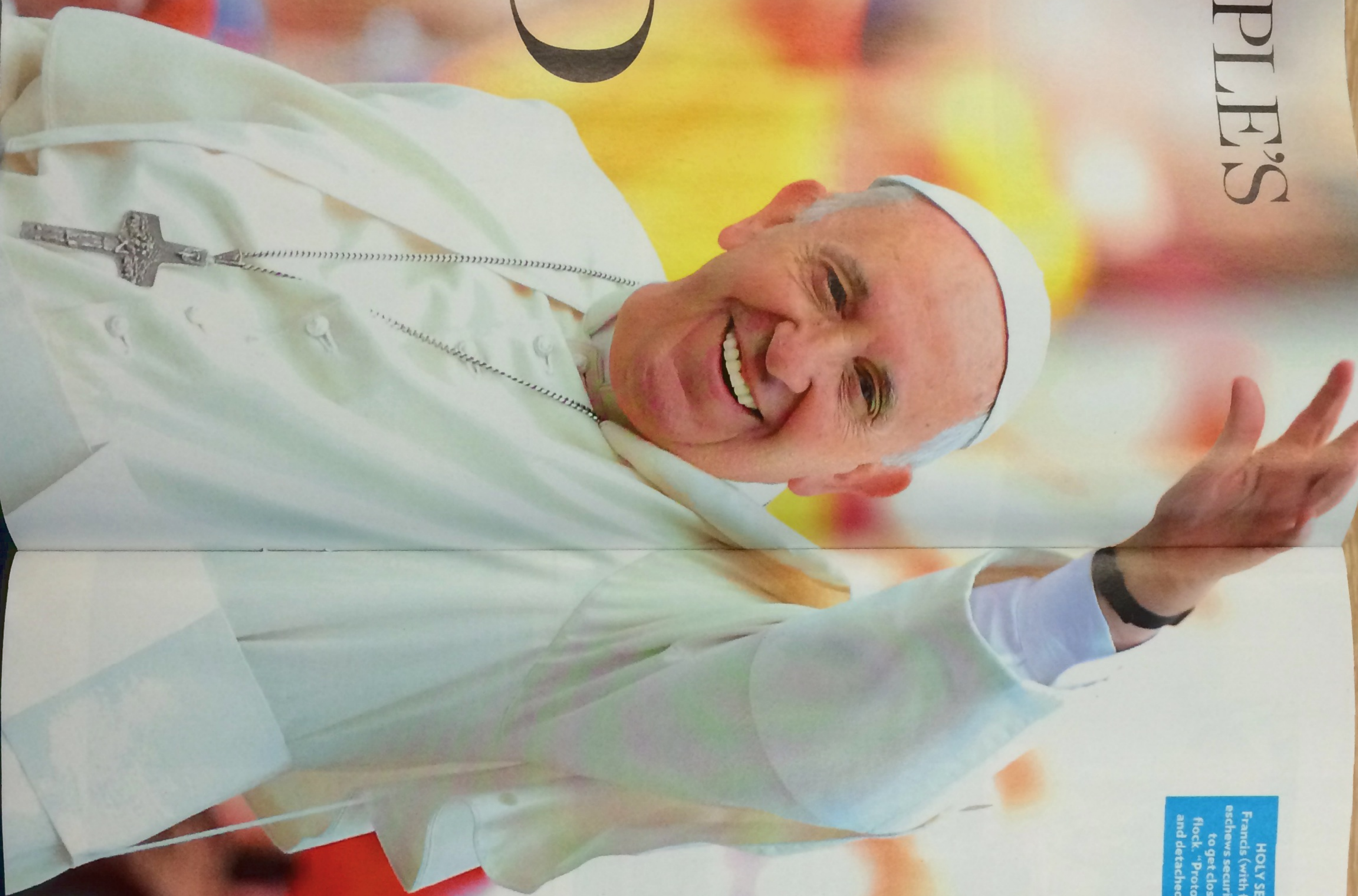
HOLY SELFIE! Francis (with fans in '13) eschews security concerns to get close to his flock. "Protocol is cold and detached," he says.